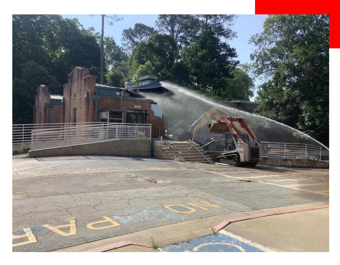
Existing gym building demolition