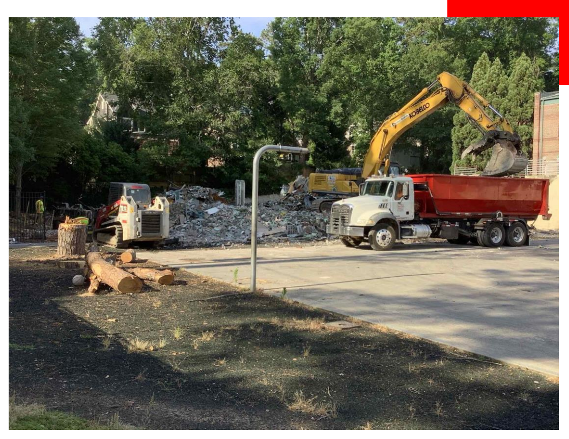
Existing gym building demolition